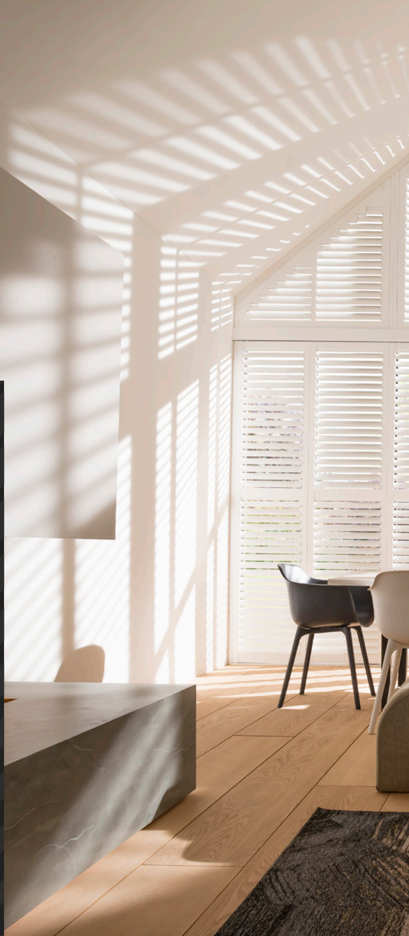
COTTON WHITE VINYL TRACKED AND SHAPED SHUTTERS