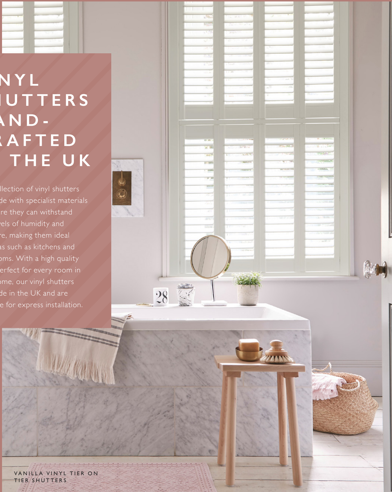
VANILLA VINYL TIER ON TIER SHUTTERS

Our collection of vinyl shutters are made with specialist materials to ensure they can withstand high levels of humidity and moisture, making them ideal for areas such as kitchens and bathrooms. With a high quality finish perfect for every room in your home, our vinyl shutters are made in the UK and are available for express installation.