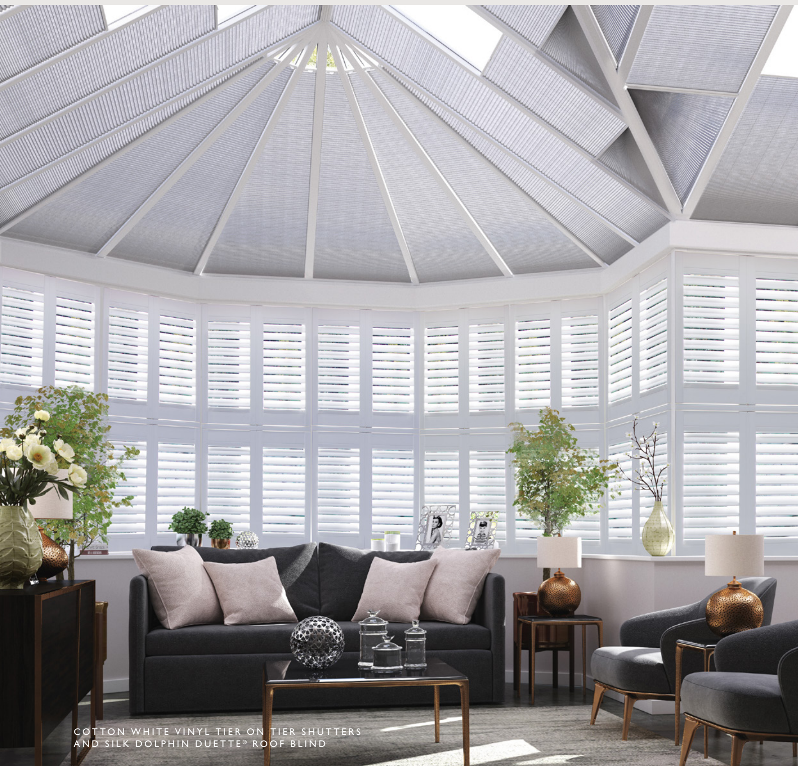
COTTON WHITE VINYL TIER ON TIER SHUTTERS AND SILK DOLPHIN DUETTE® ROOF BLIND

Perfectly designed for complex configurations and unique window shapes, we have a stunning selection of specialist blinds and shutters that will allow you to enjoy your additional space all year round. Choose from smart electric blinds for those hard to reach windows, or beautiful hand-crafted shutters that can transform your space without restricting light or style.