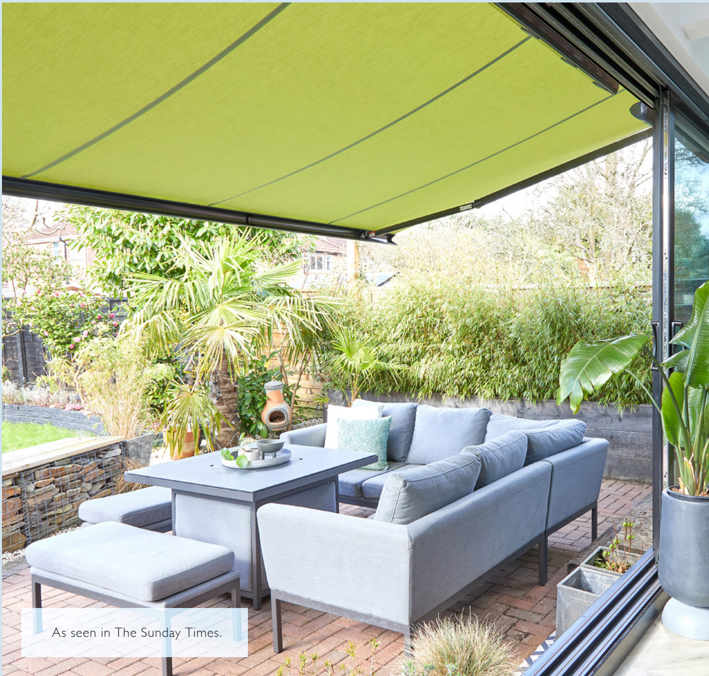
As seen in The Sunday Times.