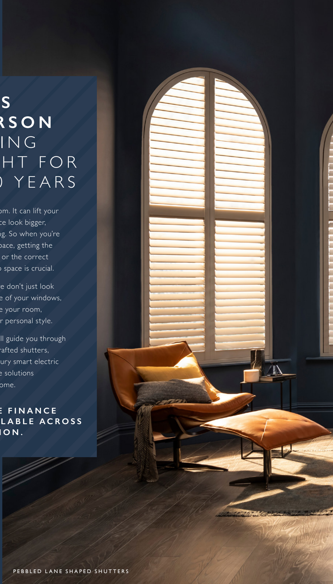
PEBBLED LANE SHAPED SHUTTERS

WE ALSO HAVE FINANCE OPTIONS AVAILABLE ACROSS OUR COLLECTION.