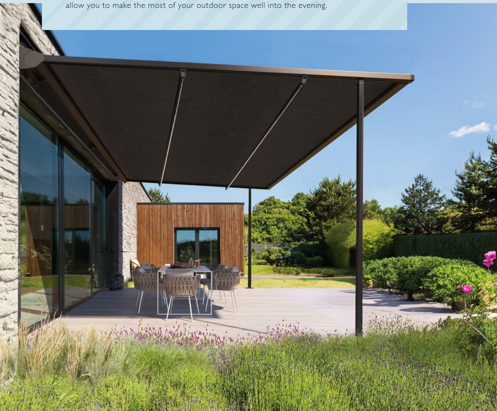
UNI SMOKE MAX FABRIC

Pergola awnings are available in a choice of 45 retractable fabrics that are available with a smart hub for simple operation via an app or with voice control using Google Assist or Alexa. LED lighting and heating is also available as optional extras, which allow you to make the most of your outdoor space well into the evening.