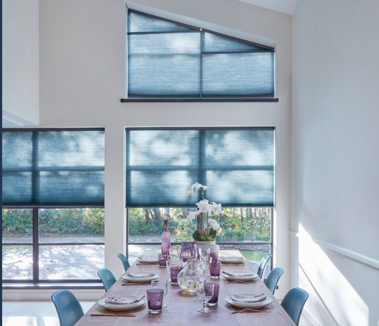
SILK DEEP BALSAM DUETTE® BLINDS