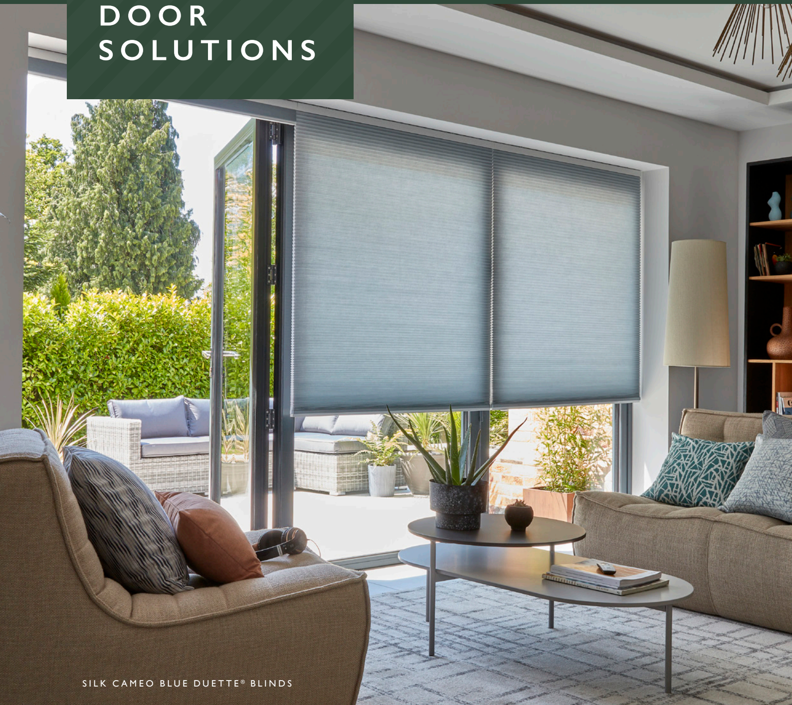
SILK CAMEO BLUE DUETTE® BLINDS