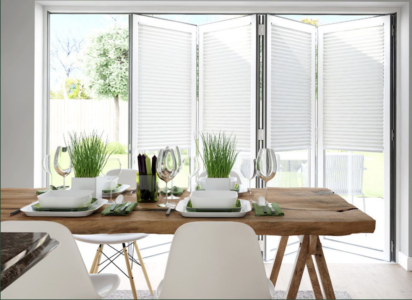
SOLARTEX CRUSH LILY PLEATED BI-FOLD BLINDS